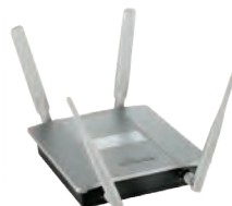
Dual Band Access Point