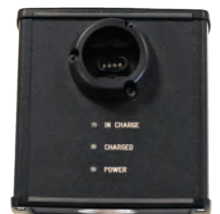
External Battery Charger Single