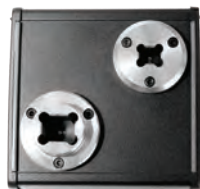
Head Recognition Programming Unit