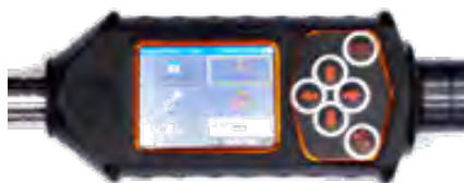
Rubber and Screen Protection

Please note: Ratchets are not included and need to be ordered separately. Neither are sockets which you can order from our Apex Bits & Sockets assortment.