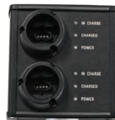
External Battery Charger Dual